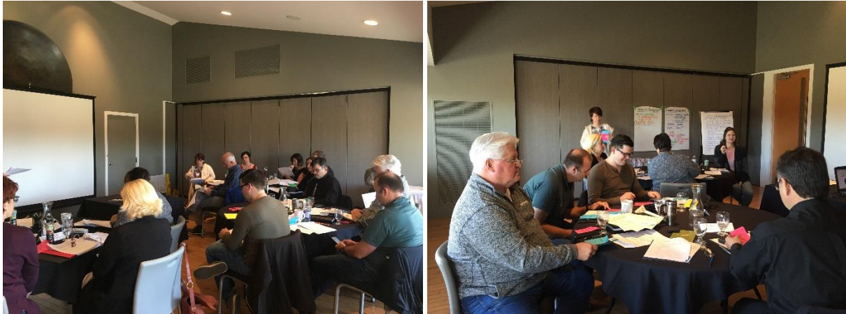
Community Foundation Board of Directors are working together on our strategic plan.

Our Board of Directors and staff spent Saturday, October 27th strategic planning at Desert Blume Golf Course. The venue was great and the discussions were even better. The passion and enthusiasm that our volunteers bring to the Community Foundation is truly valued.