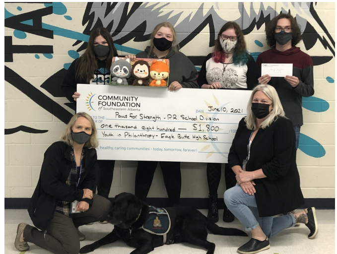
Eagle Butte High School Presenting to Paws for Strength

Thank you to the 11 school groups who participated in Youth in Philanthropy this year!