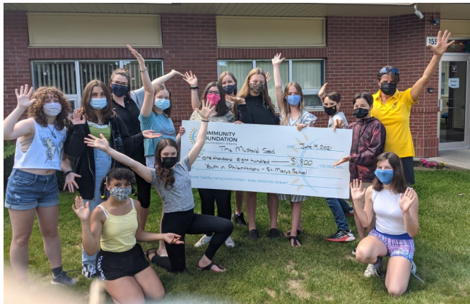
St. Mary's School Presenting to The Mustard Seed

Youth in Philanthropy (YiP) is a leadership development initiative which is designed to introduce motivated young people to philanthropy and local community development. Students research the community's greatest needs and then select an organization whose mandate may address those needs to receive a grant through the program.