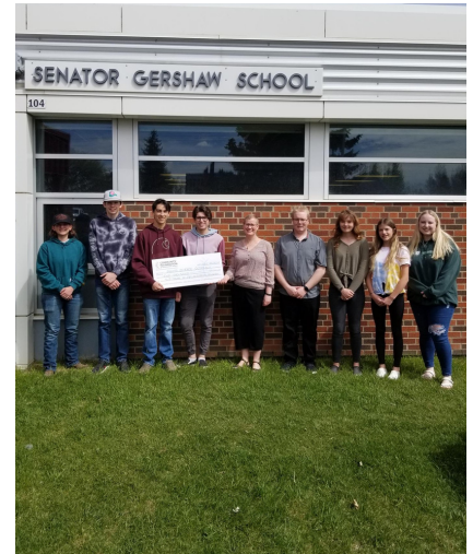
Senator Gershaw School cheque presentation to Praxis Science Outreach Society for $2,000