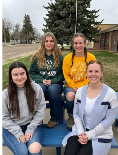
St. Michael's School YiP participants chose Nuture Pregnancy Centre for a $2,000 donation